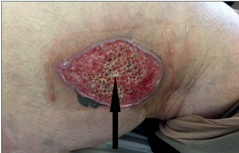
Figure 4. 3 rd degree burn site prior to treatment with Theresienöl.