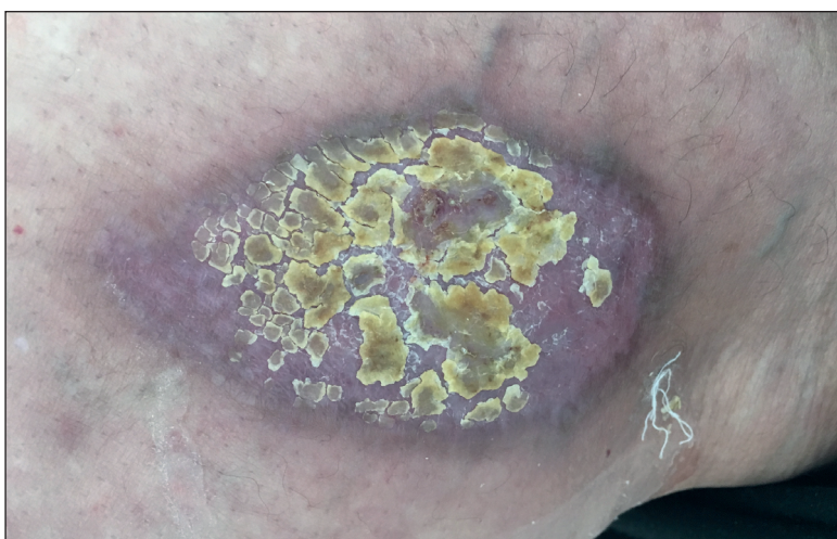
Figure 6. Completely healed wound after 37 days of treatment with Theresienöl.