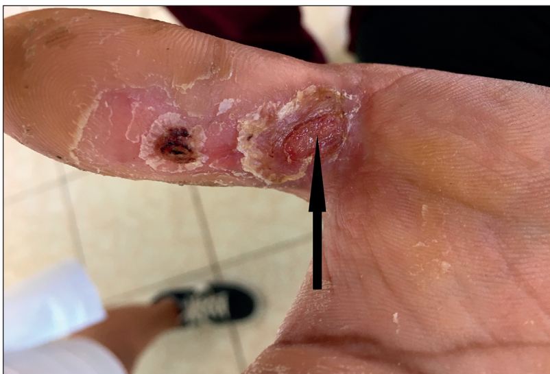
Figure 2. The 3 rd degree burn site a week after the treatment with Theresienöl.