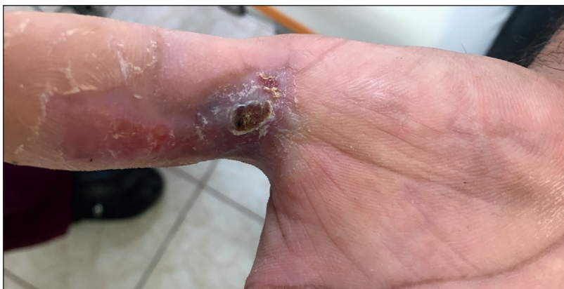
Figure 3. Completely healed wound after 14-day treatment with Theresienöl.

Postoperatively, local, antiseptic treatment with silver dressings for about 14 days was applied. We noted unsatisfactory healing, with presence of suppurative exudate in the wound bottom, and decided to move on to local treatment with 2 drops of Theresienöl once daily, covering the site with wet gauze, to avoid the oil soaking in (Fig. 1).