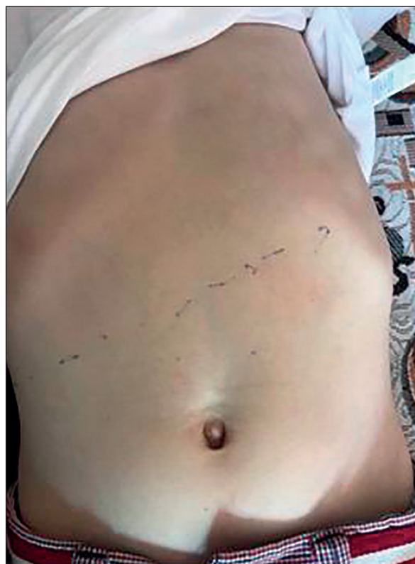
Figure 1. Picture of the abdomen (hepatomegaly is marked on the picture)

The gastroenterologist prescribed treatment with ursodeoxycholic acid 20 mg/kg/day and polyunsaturated fatty acids (omega 3) 800 mg/day. The rapid disease course, persistent hepatosplenomegaly, despite treatment with hepato-protectors, cholagogues and choleretics, changes of the lipid profile indicated a lipid metabolism disorder and gave rise to the suspicion of a rare genetic pathology. The child was referred to the Hepatology Centre of the "Institute of Paediatrics, Obstetrics and Gynaecology of the